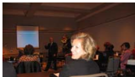
The Honorable Crystal Crump, Union County Register of Deeds