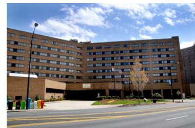
Best Western Motel and Conference Center High Point, NC

Here a few ideas for things for you and your family to do when you come for the conference the weekend of October 24th in High Point.